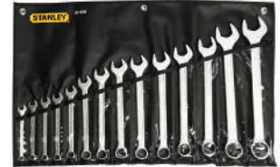
STANLEY 87-036-1, 87-038-1, 87-709-1