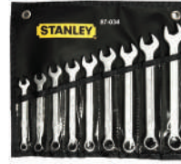
STANLEY 87-033-1, 87-034-1