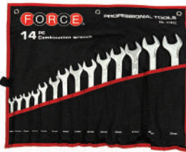
FORCE 5141, 5141S